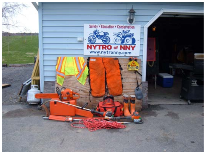
Doing it safe