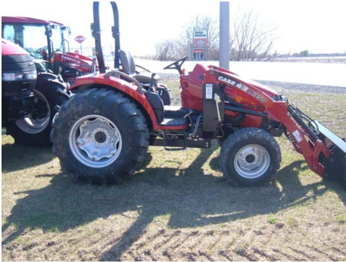
Grant Tractor we are applying for