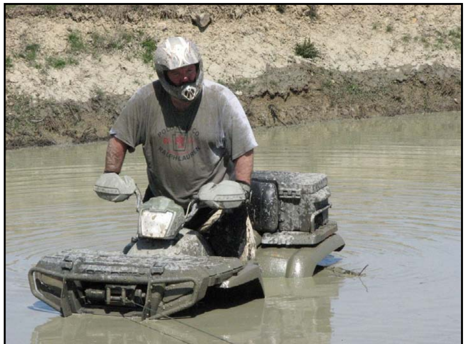
A Poker Run Participant Stuck in the Mud!