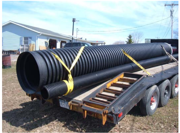
Big dent out of Trail Fund