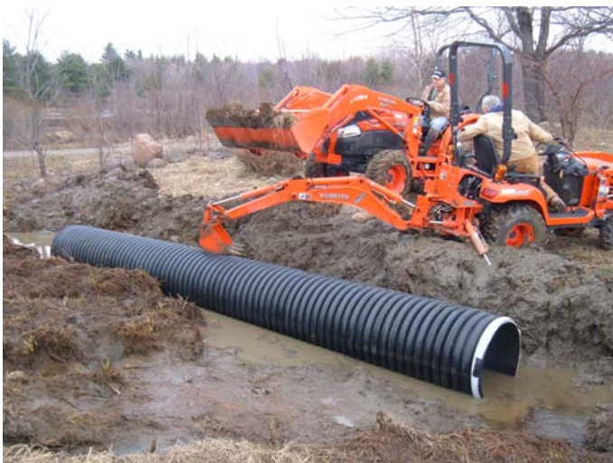
Team Kubota to the rescue